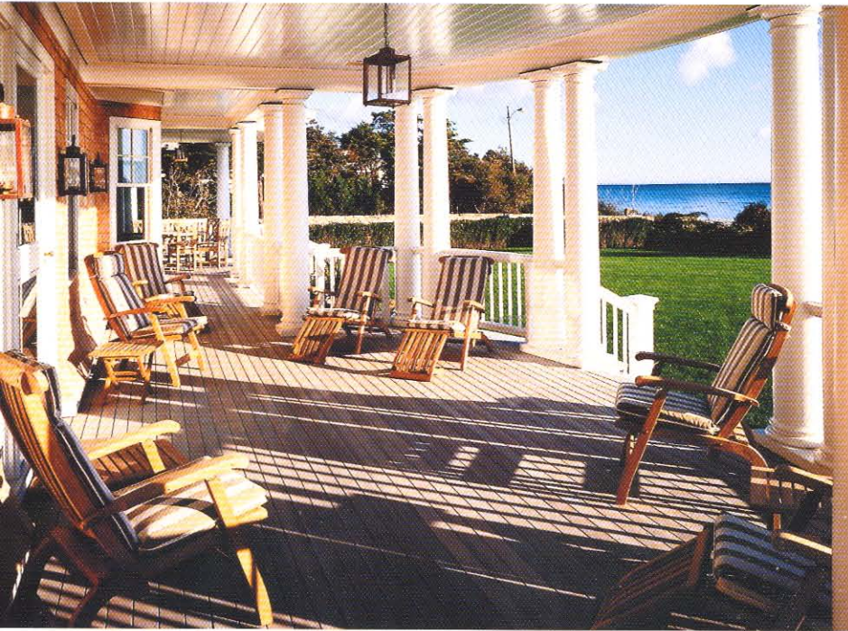
A WIDE PORCH HARKENS BACK TO A PERIOD WHERE LEISURE TIME MEANT SPENDING LAZY DAYS OUTDOORS. BEADED CEILINGS WERE OFTEN PAINTED BLUE TO MATCH THE SKY.