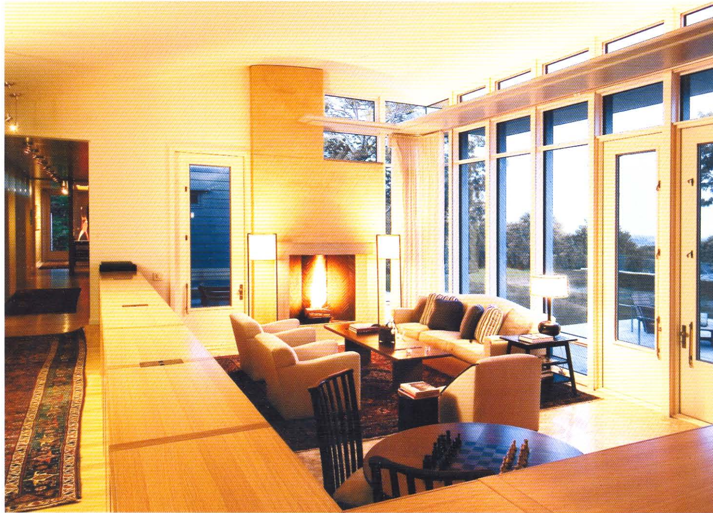
THE SUNKEN LIVING ROOM CREATES A COZY CONVERSATION PIT.