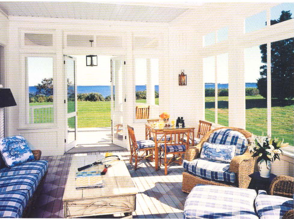
A SCREENED-IN SUN PORCH FEATURES FLOORING WITH A DIAMOND PATTERN GIVING AN OUTDOOR ROOM AN "INSIDE" FEEL.